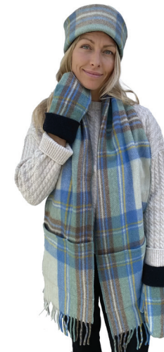
Stewart Blue Muted

Our Wool Luxe-Lined Pocket Scarf wraps you in the ultimate softness & warmth. Crafted with warm wool and lined with plush polar fleece, for a cozy, gentle touch against your skin. The 4 handy pockets are pattern-matched for functional elegance.