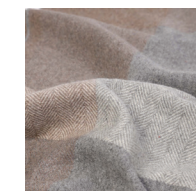
Light Natural Check