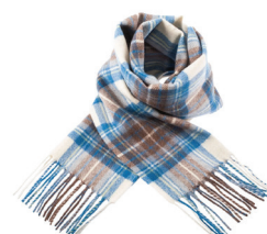
Stewart Blue Muted