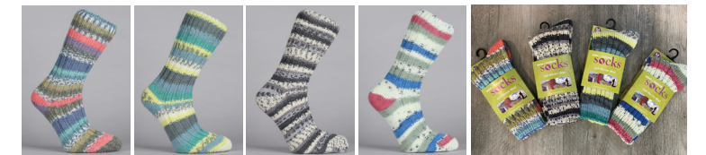
Aqua Green Charcoal Royal