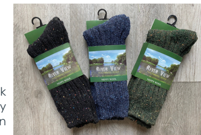
Black Navy Green