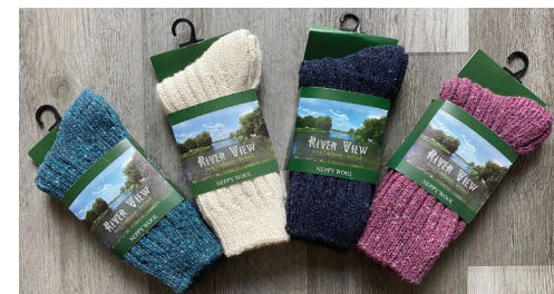
Turq Ecu Navy Pink