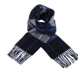
Mixed Check Blue