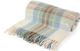
Stewart Blue Muted