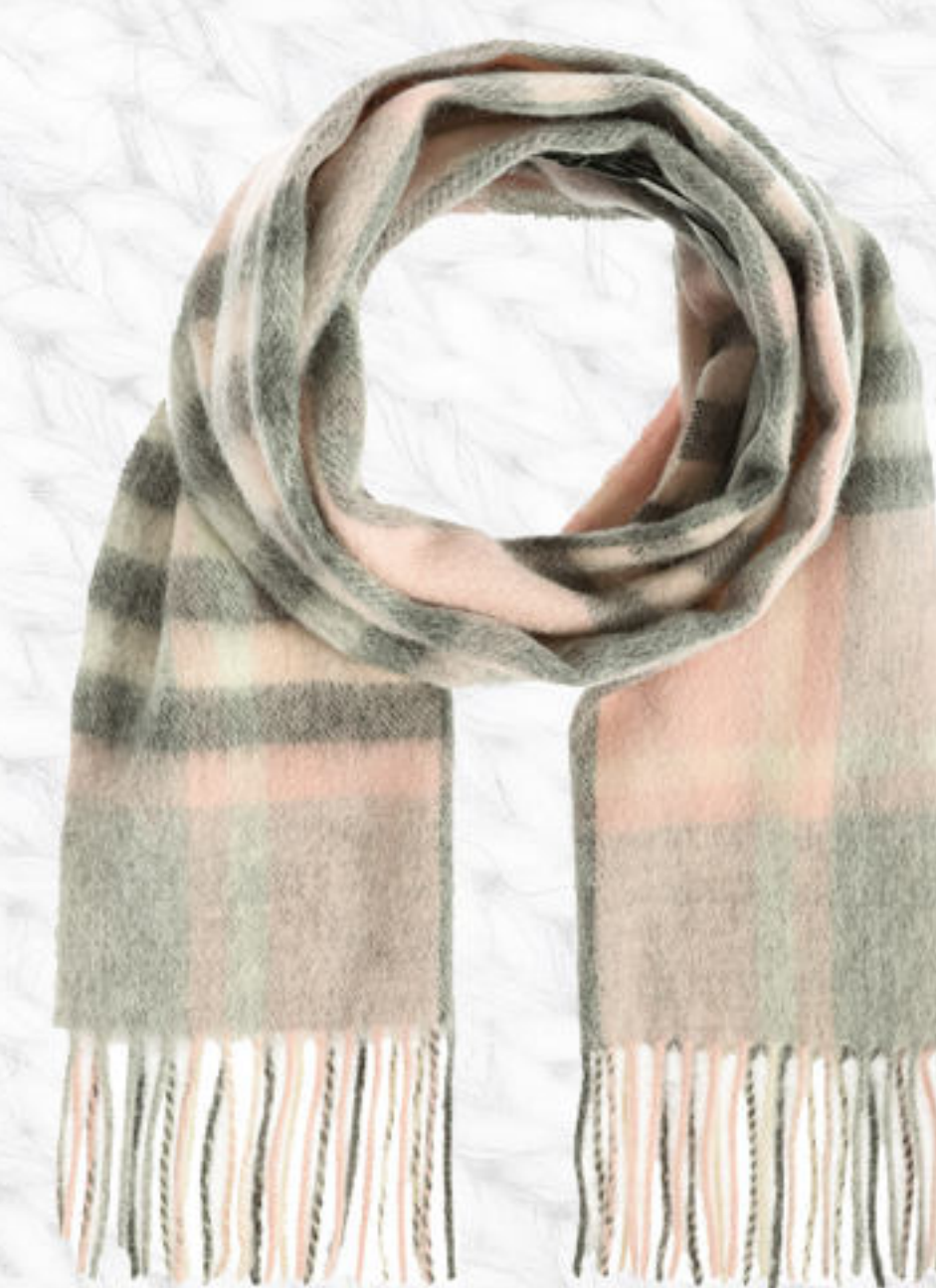
LIGHT PINK GREY