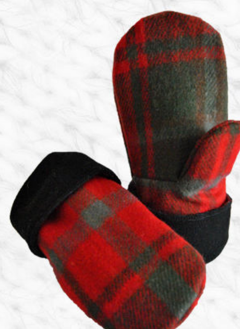
CANADIAN DARK MAPLE LEAF