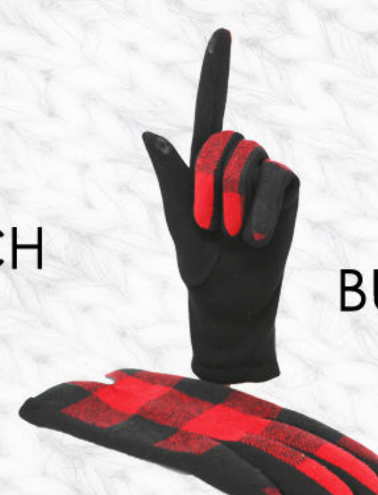
RED BUFFALO PLAID