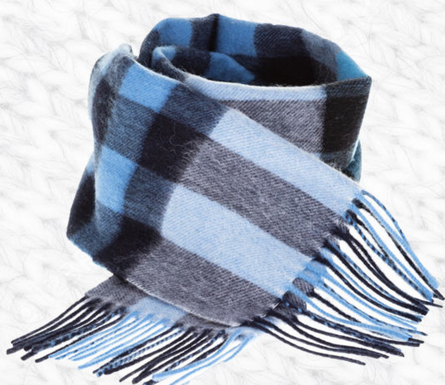
CHECK NAVY BLUE