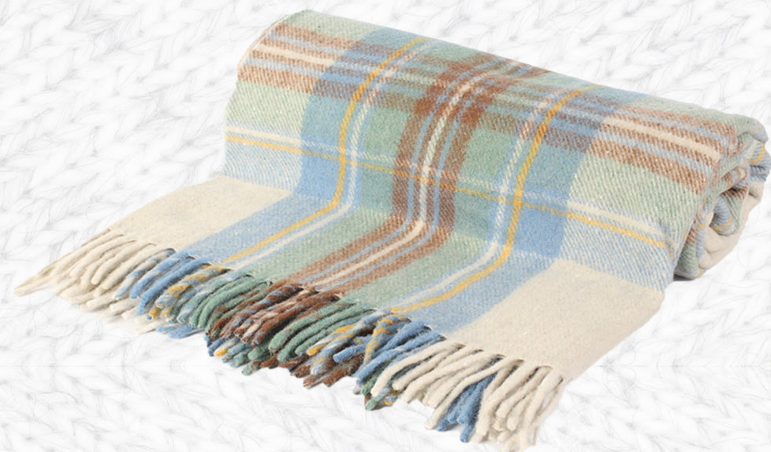
STEWART BLUE MUTED