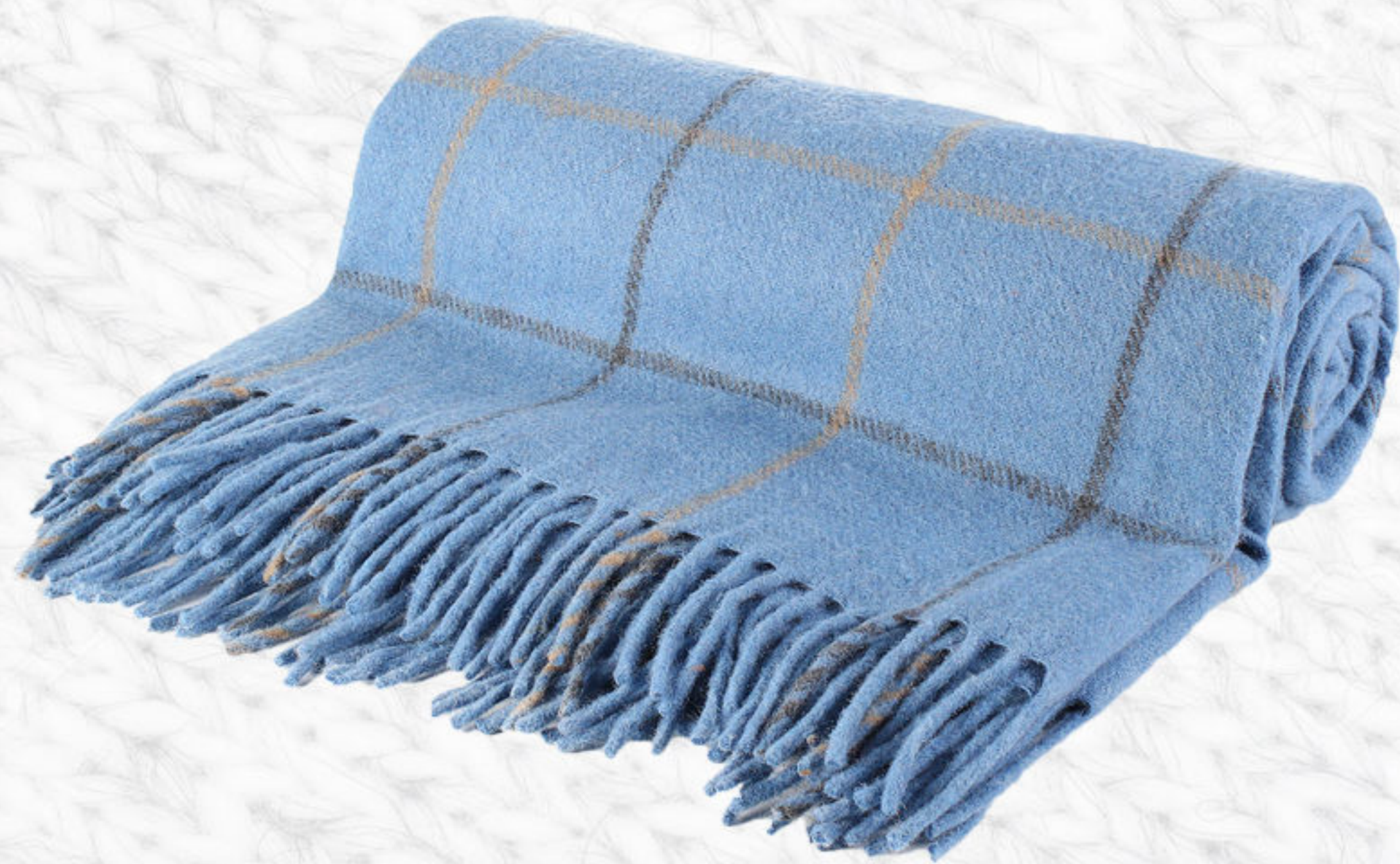
CHECK SKY BLUE