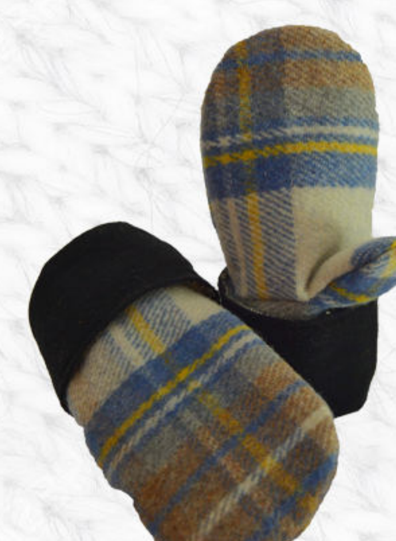
STEWART BLUE MUTED