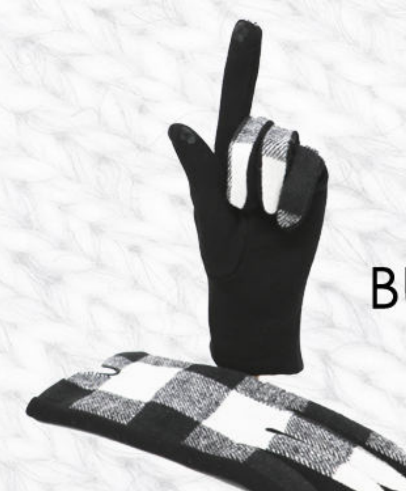
WHITE BUFFALO PLAID