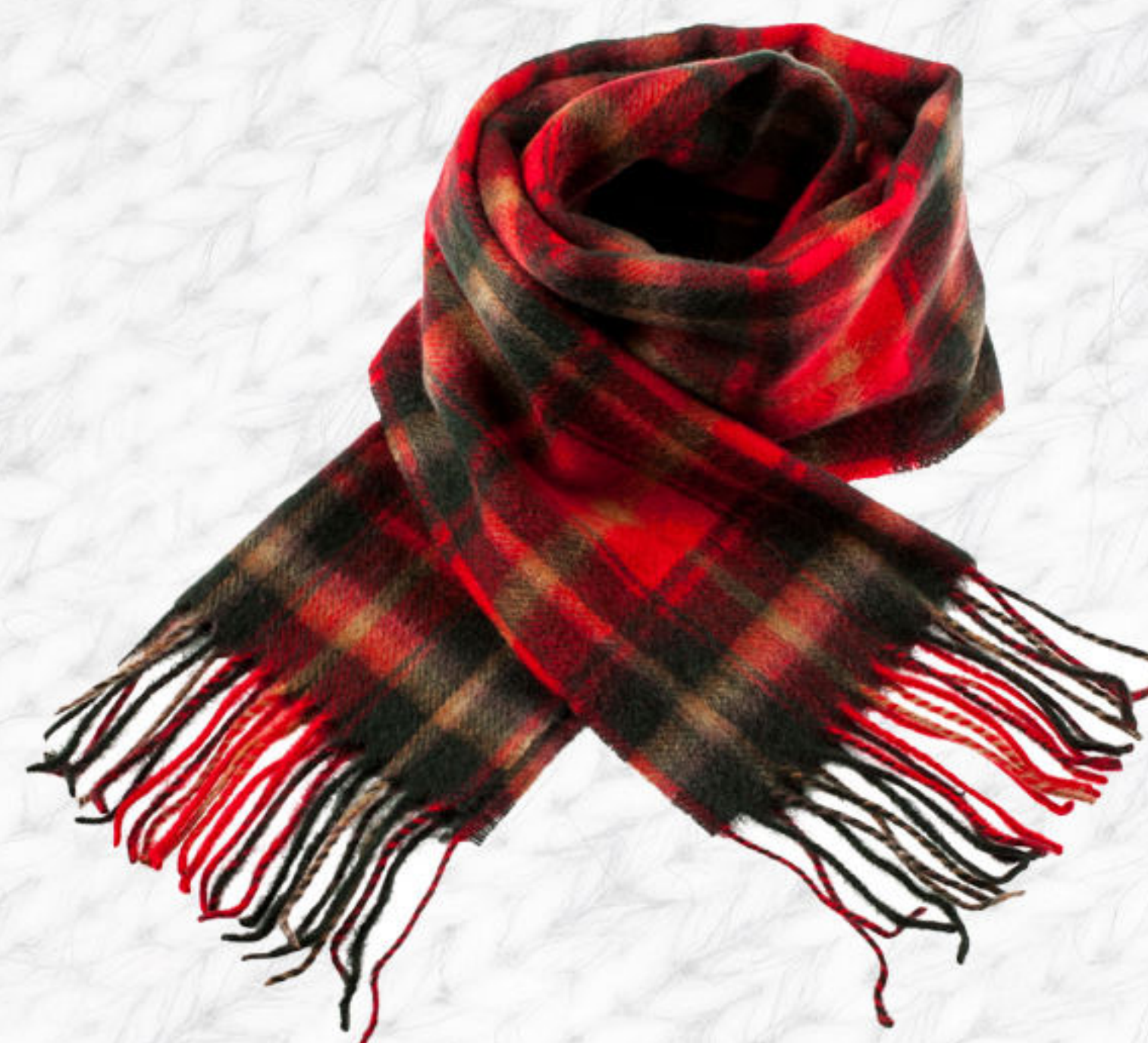
CANADIAN DARK MAPLE LEAF