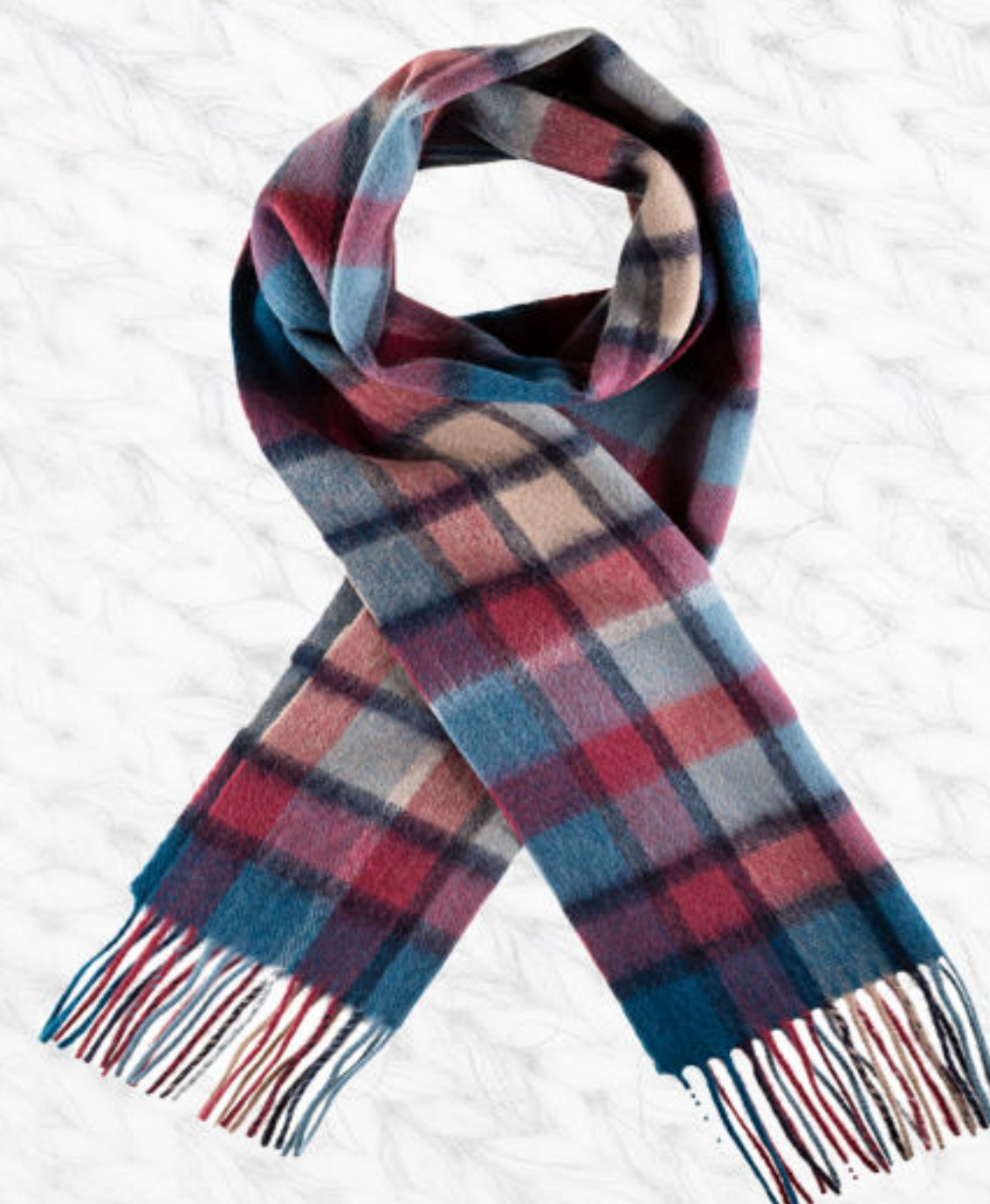
CHECK ASHLEY BLUE PINK