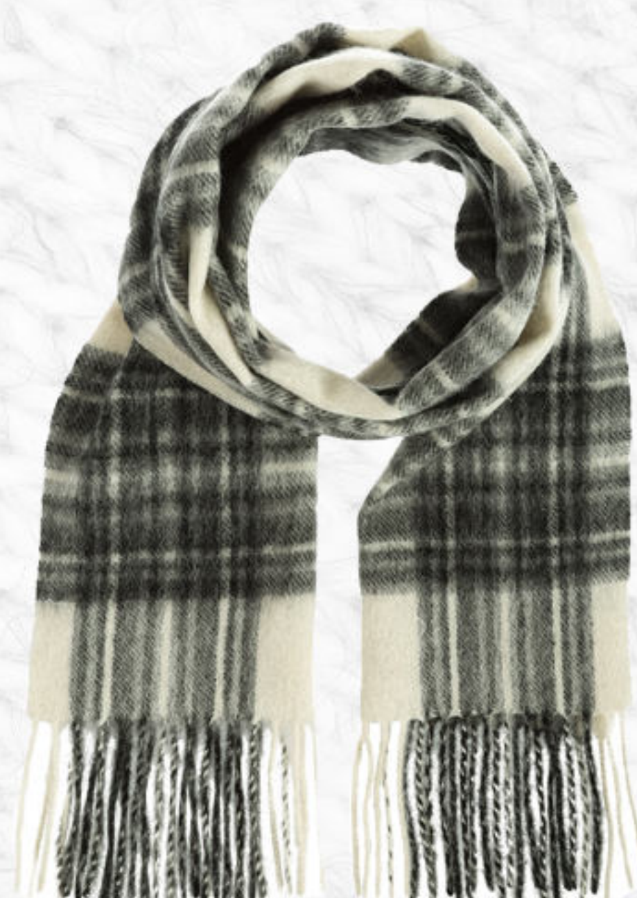
GREY DRESS STEWART