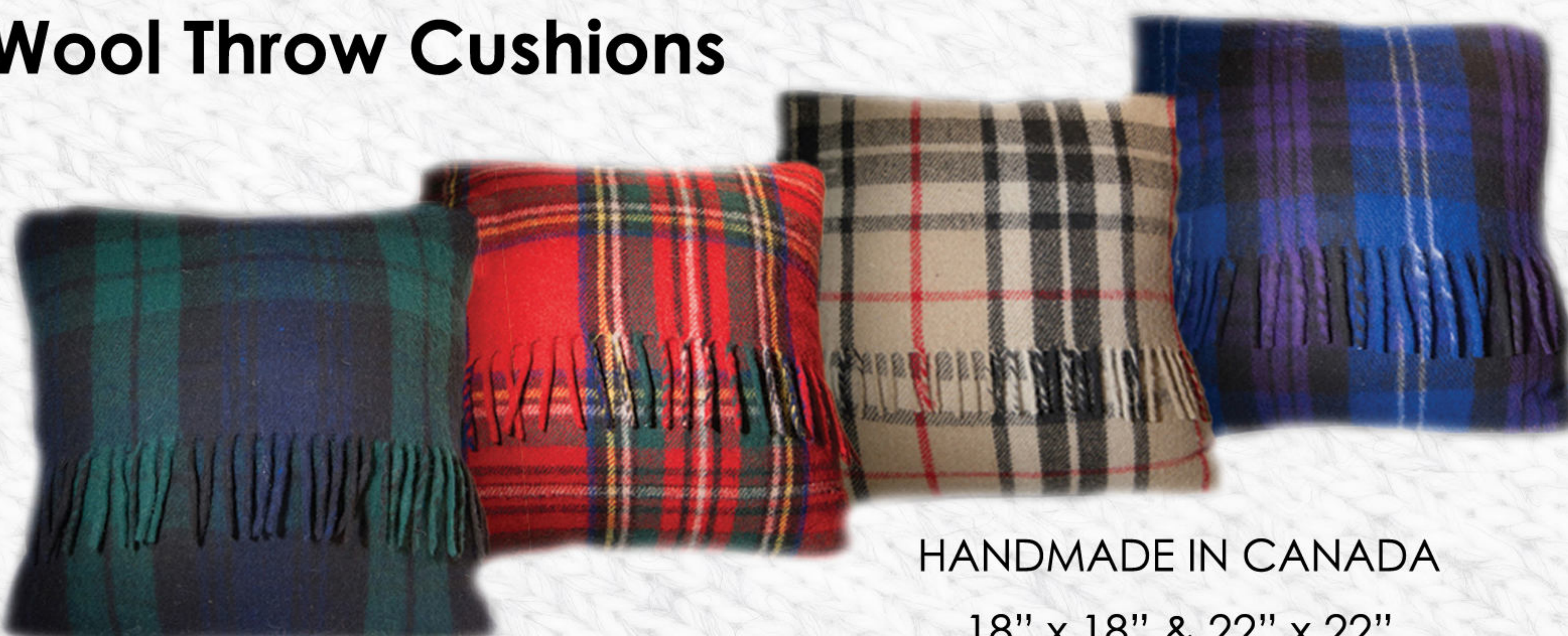
HANDMADE IN CANADA 18" x 18" & 22" x 22"

The exclusive brand sold across the UK and Canada.