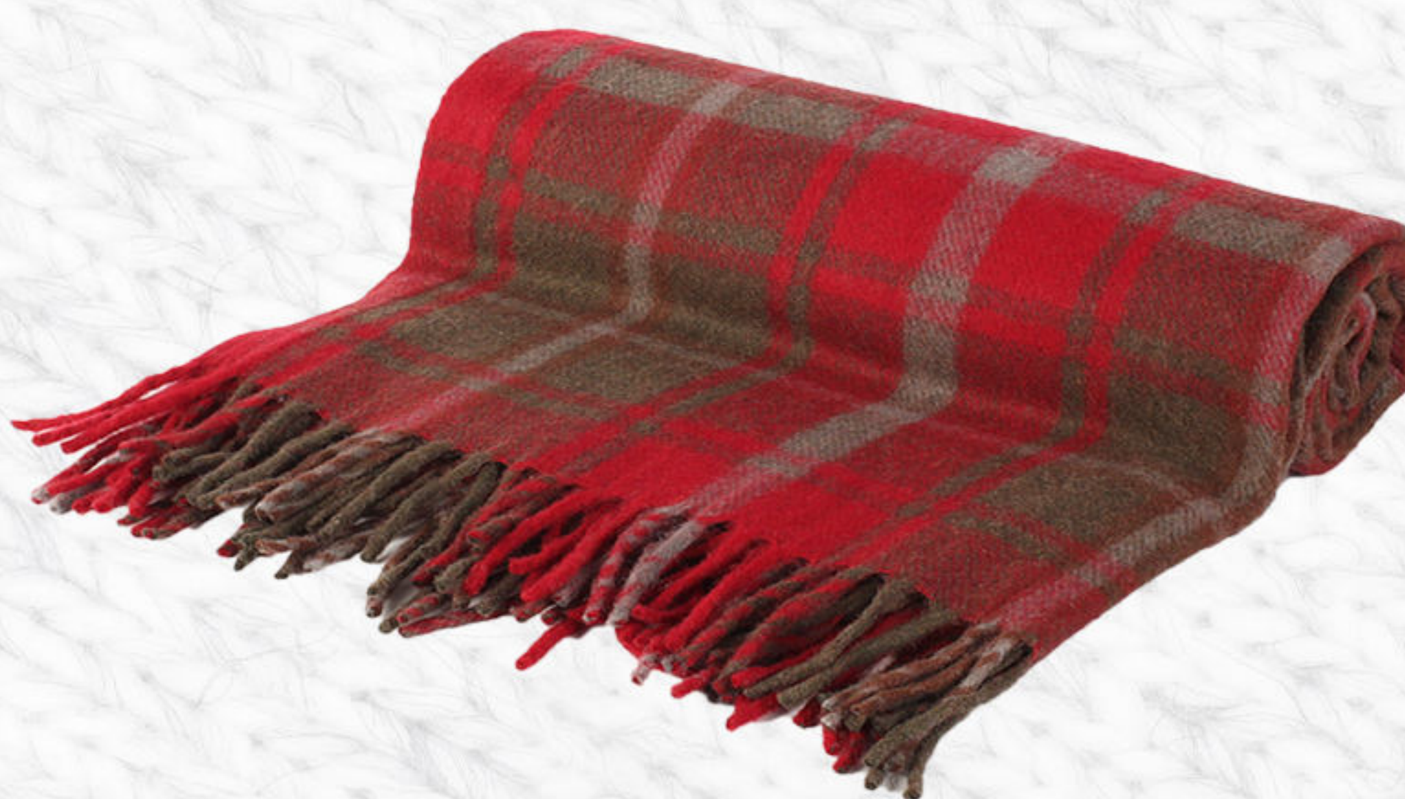
CANADIAN DARK MAPLE LEAF