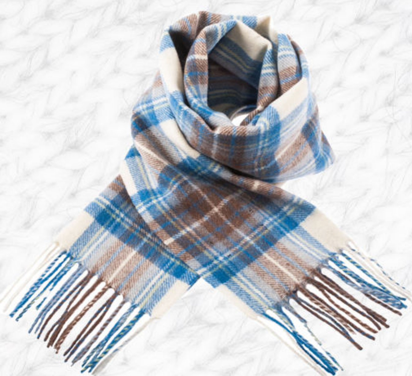
STEWART BLUE MUTED